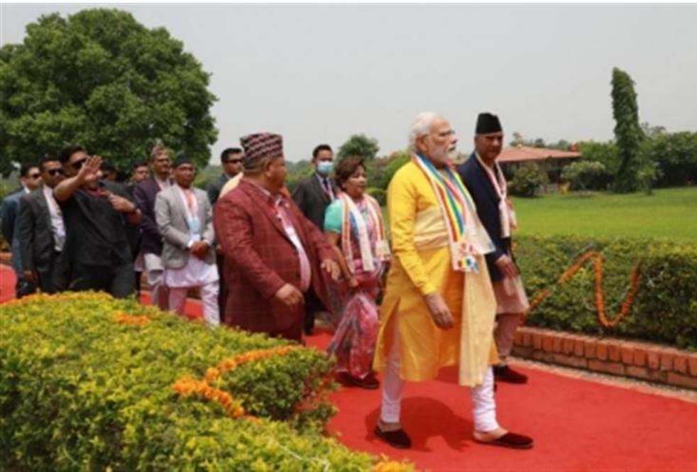
A file picture of Prime Minister Narendra Modi's visit to Lumbini