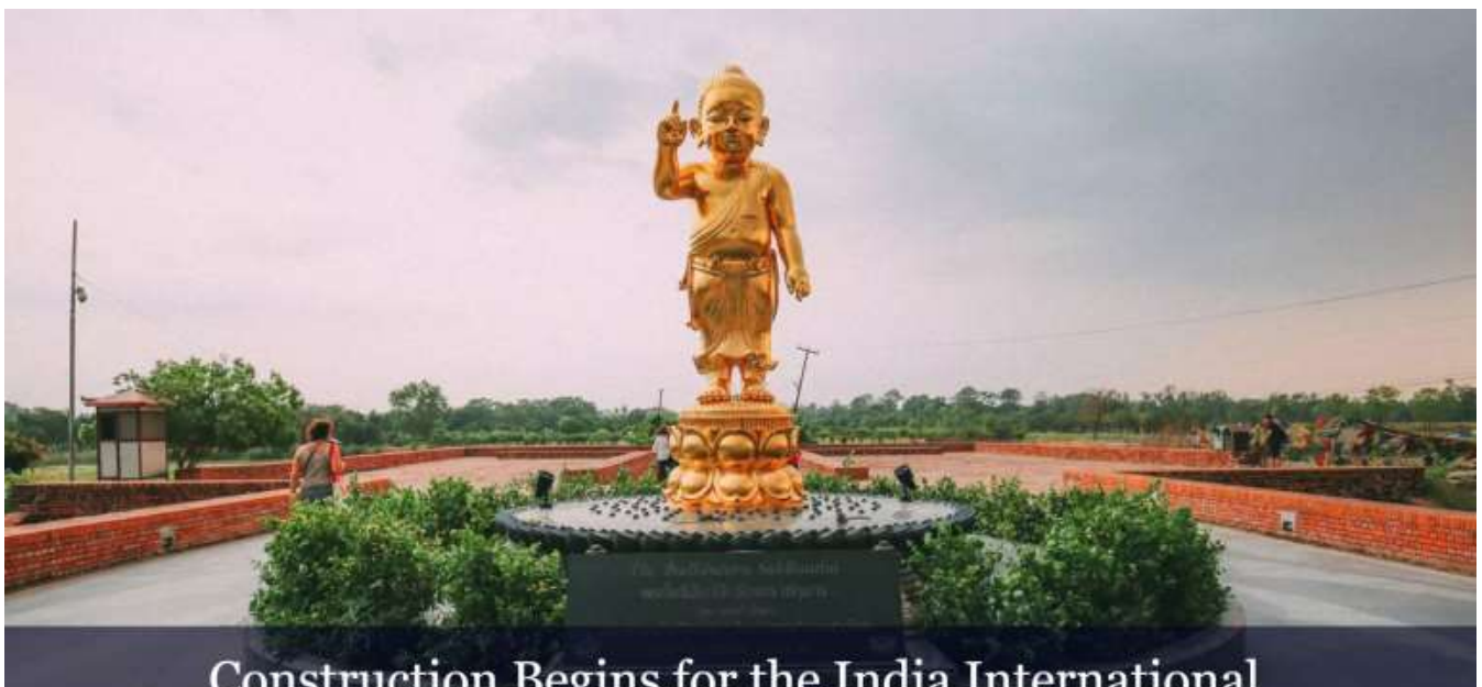
Construction Begins for the India International