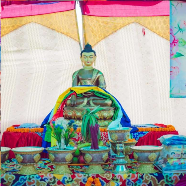
IBC joyously celebrated the Bhoomi Pujan ceremony of the