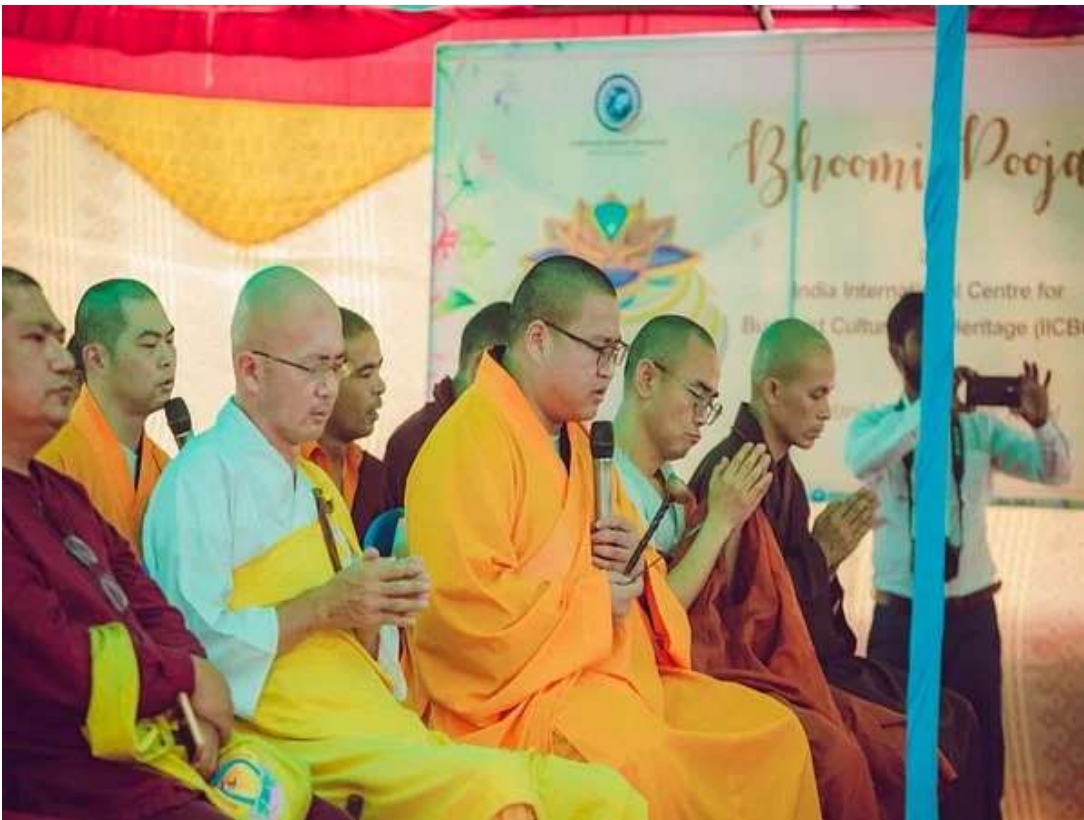
The event saw the participation of 250 distinguished guests, including 150 Monks and 100 devotees